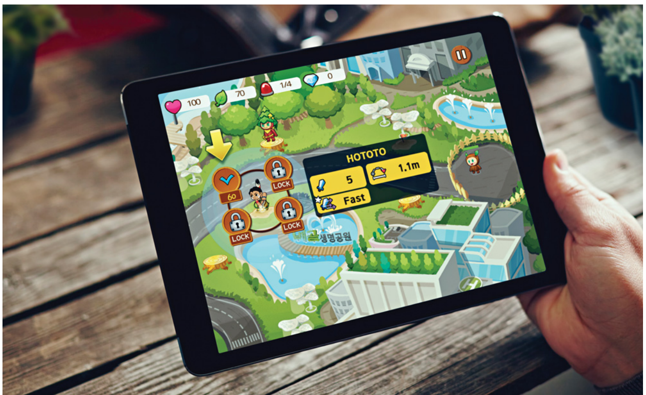
The iPad version of the third edition of the TreePlanet game.

TreePlanet’s game is simple, as is the revenue model. Users feed and water digital trees and achieve points for growth and, like many other social games, they can buy items such as watering cans to grow their trees faster. These purchases allow users to feel that they contribute to TreePlanet’s forestry campaigns directly, though the company’s largest revenue stream was in-game advertising from corporations “seeking a ‘green halo’ effect,” according to Jeong. There were more than 500,000 downloads of TreePlanet 1 in the first two years, in part because its entry into the casual