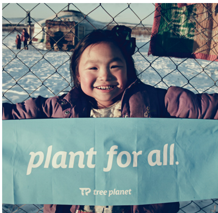
A Mongolian girl spreads the TreePlanet message.

A cross the globe, advertisers spent nearly US$600 billion in 2015 on traditional, digital, and mobile platforms in the battle for mindshare, according to the research group eMarketer. The business of changing hearts and minds is a big one, and nowhere more so than in South Korea, where some US$10 billion was spent the same year on the selling of goods, products, and ideas. In 2010 a small enterprise stepped into the fray, but with a clear social mission in mind. Korea's growing green economy and the value that corporations and individuals were now placing on environmental issues convinced TreePlanet's young co-founders Jeong Mincheol and Kim Hyungsoo that there was an opportunity to make money from products and services that encouraged people to become personally vested in combatting climate