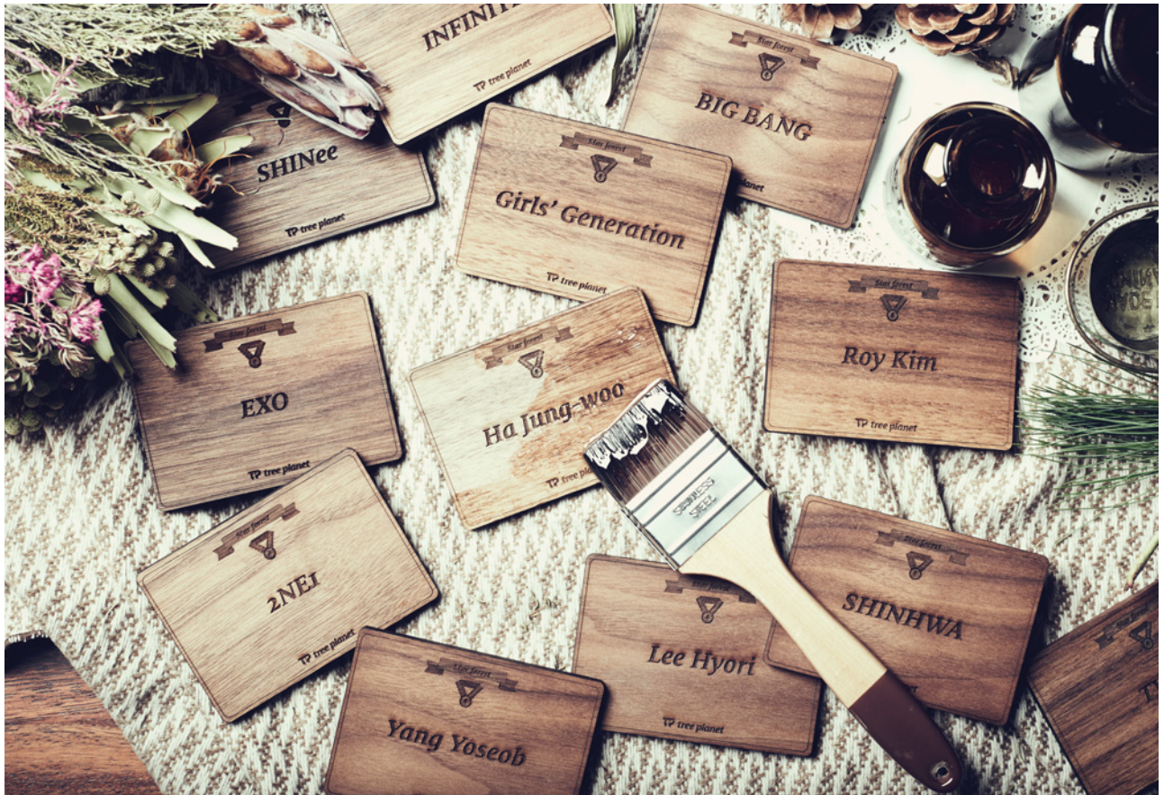
TreePlanet works to personalize tree planting projects on behalf of its clients.

turn destroyed thousands of hectares of farmland and displaced hundreds of thousands of people. Reclaiming forested land became a cornerstone activity of South Korea's post-war reconstruction efforts. The National Reforestation Program, which began in 1962, channeled national resources into tree-planting initiatives on a massive scale, resulting in an average 200,000 hectares of forest planted annually between 1966 and 1980. Today, South Korea's forest cover makes up 64 percent of the country's land area.