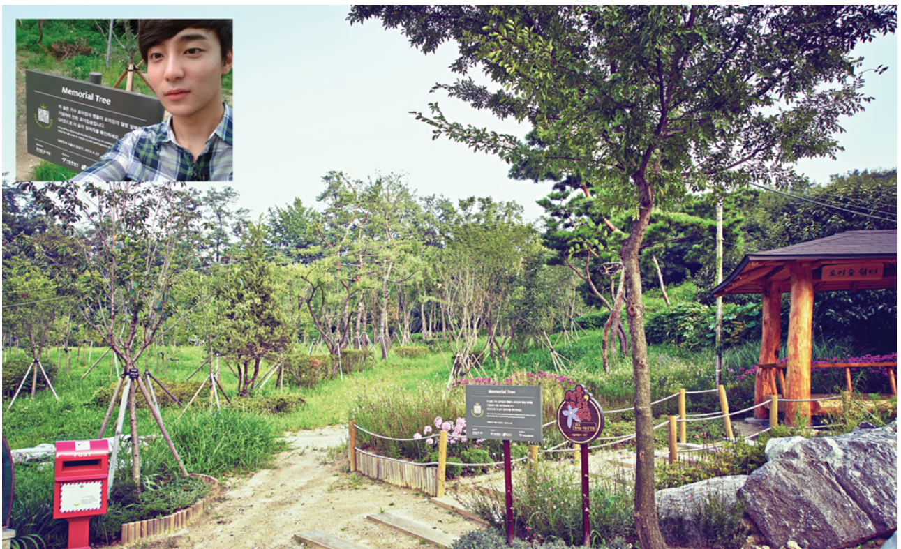
The Roy Kim Star Forest in Seoul.

Another important partnership TreePlanet has forged has been with SK, a chaebol with US$157 billion in 2014 revenues from large integrated