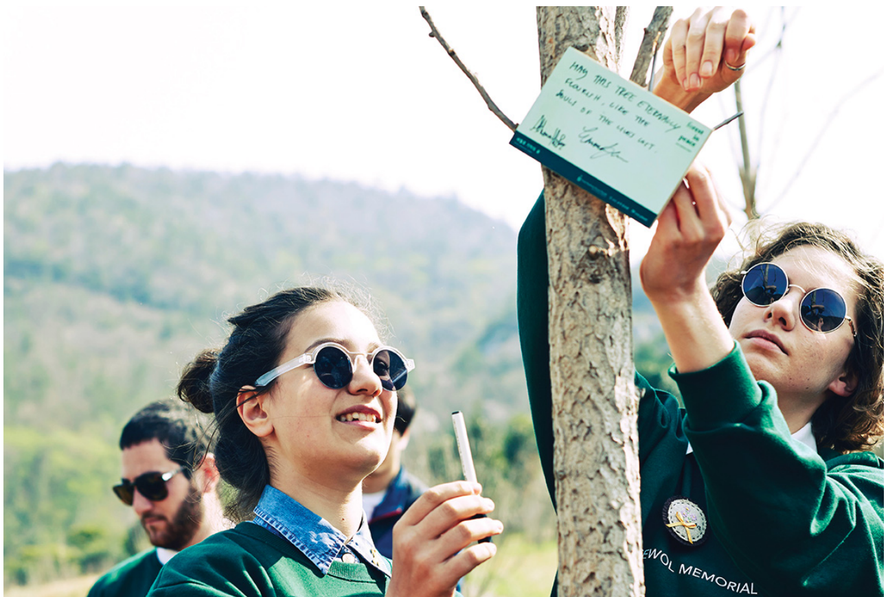
The Forest in Peace project commemorating the victims of the MV Sewol ferry disaster in 2014.

In building a profitable business with roots in socially minded principles, the company stands out among a new breed of Korean social entrepreneurs who have been driven by the belief that it is possible to do well by doing good, drawing the attention of the South Korean conglomerate SK Group.