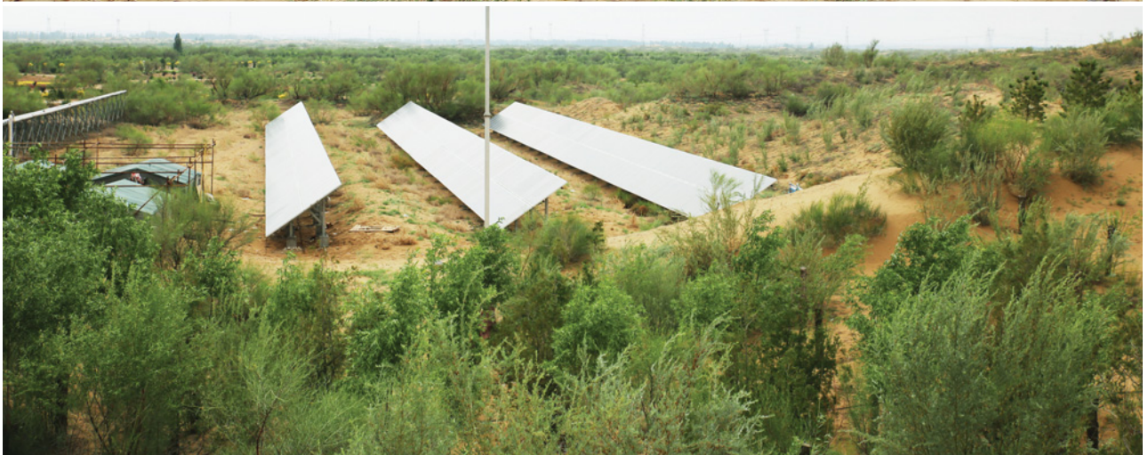
A reforestation project in China sponsored by Hanwha Chemical Company on one of its own solar panel installation sites in 2013 (above) and 2015 (below).